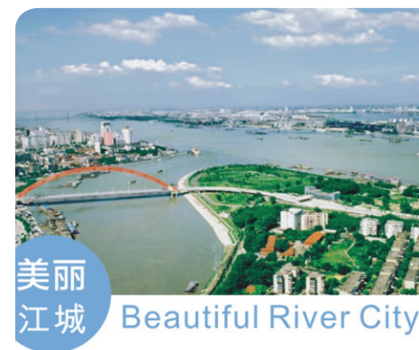
美丽江城 Beautiful River City

Wuhan is one among the first batch of cities formulating the national fitness program, with national fitness activities widely promoted in the city and various gymnasiums built in its three towns.