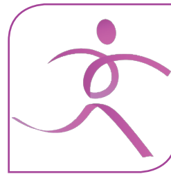
Inside ISF A School Sport Foundation