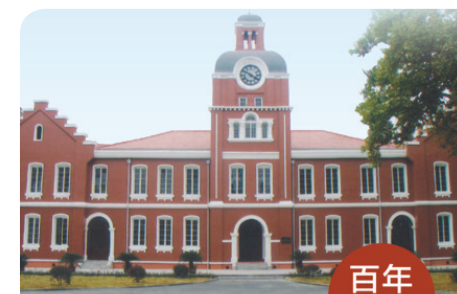
Century No. 4 High School

Established by the British Christian London Missionary Society in 1899 with the original name of Hankou Boxue Middle School (Griffith John Middle School), Wuhan No.4 High School & Boxue Middle School is one of the schools with the longest history in Wuhan. With an area of 160 mu, Wuhan No.4 High School is the largest school in the central urban area. The antique church and bell tower have witnessed the history of a hundred years, while the modern teaching buildings and science and technology building are transmitting the modern civilization.